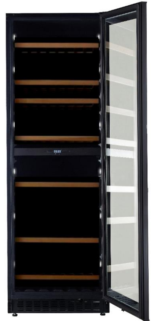
Loading plan based on traditional Bordeaux 750ml bottles